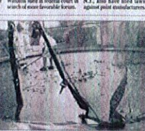
Tidying up the trampoline